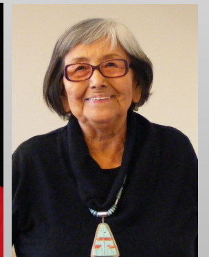
Row 3 (Left to Right):