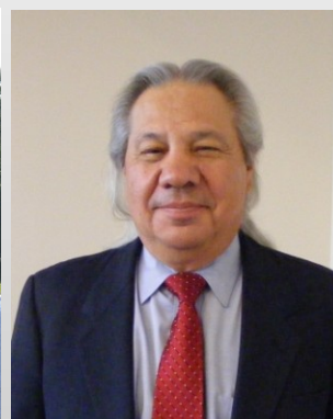
Row 2 (Left to Right):